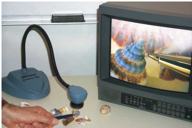
Camera 101 in a typical set-up viewing a small object.